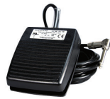
A803 Footswitch †