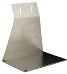
A813 Table Top Stand †