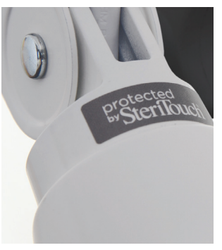
Protected by SteriTouch® antimicrobial powder coating