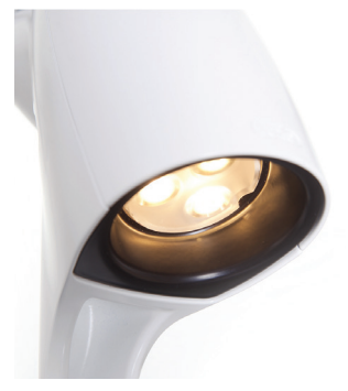
Recessed light source inside light head to reduce glare.