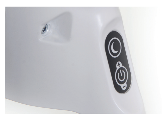
Dimming and integrated "night-watch" for user comfort and convenience.