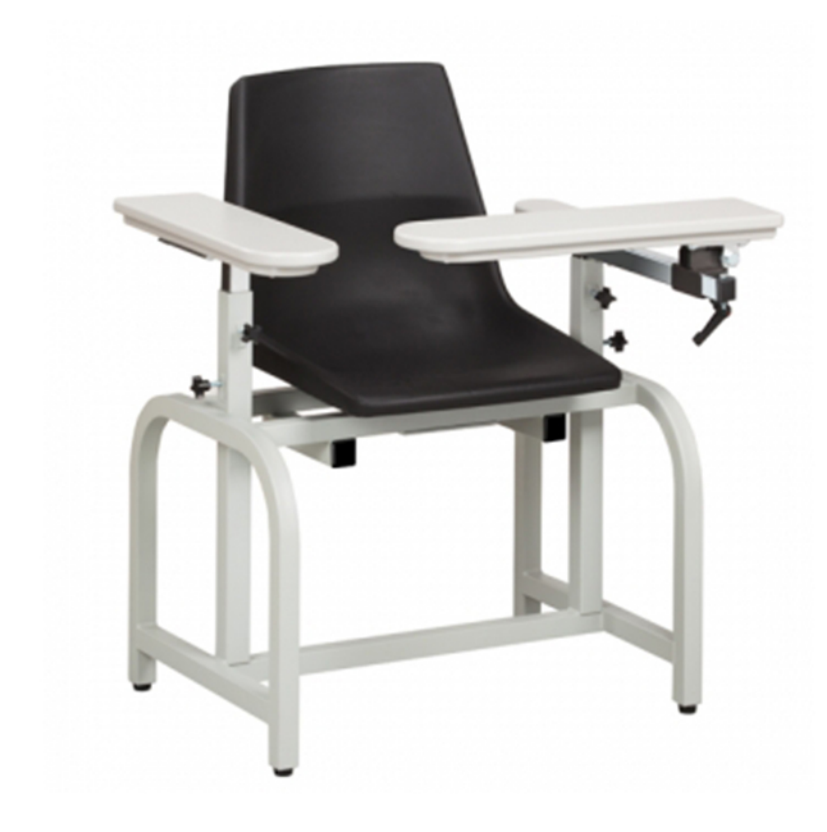
CLN66060-P Blood Drawing Chair with Flip Arm $425.00/Each